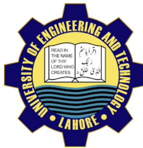
Figure 1.2 UET Logo