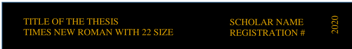
Figure 2.1 Sample Formatting for The Spine

Your thesis is one of the most significant writings you would ever write in your academic career. We hope this template helps for that. Good Luck!